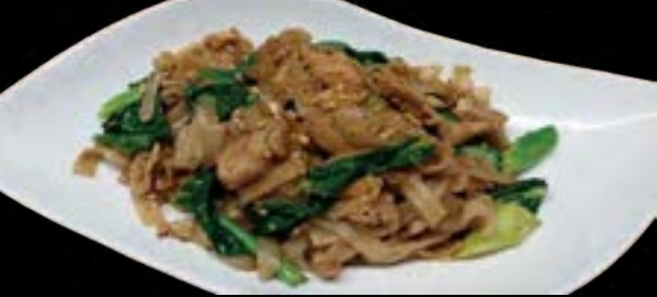
55. Original Pork Fried Rice Pork fried rice with broccoli and eggs. 18.95

56. Pineapple Chicken Fried Rice 峰 🥙 Chicken fried rice with curry powder, pineapple and cashews. 18.95